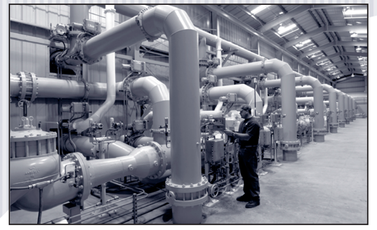
Casitas invests extensively to maintain its infrastructure. For example, Casitas recently replaced many of its aging pumps and upgraded its pumping facilities at a cost of more than $2 million.

Casitas Municipal Water District faced escalating fish passage facility, maintenance, and water conservation costs this year. The Board met throughout May and June to creatively tackle these costs concerns. The Board supported strategic cost savings to try and keep water revenue increases to roughly nine percent or under for the 2006-07 fiscal year.