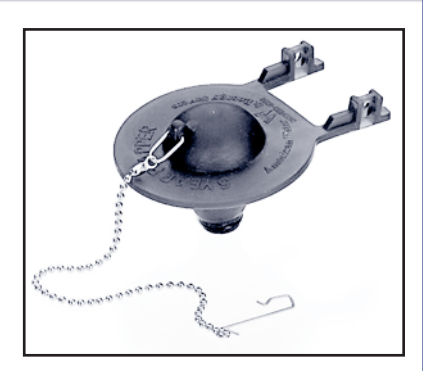
Free toilet flappers are now available at Casitas' main office in Oak View.

Leaky toilets are more than a nuisance. They waste water and cost you money. Casitas is giving away toilet leak detection kits that include blue dye tablets. Place one in your toilet tank and wait for 15 minutes. If the blue color appears in your toilet bowl, you have a leak. You may be able to remedy the problem by installing a new toilet flapper. These parts usually do not last for more than five years.