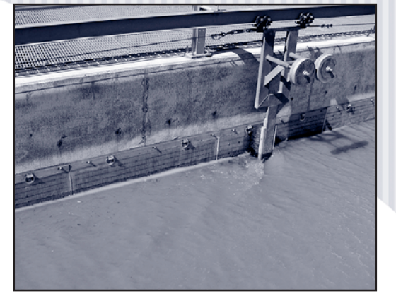
Fish passage screens cleaned.

What is the difference between a trout that goes to the ocean and a trout that stays in a freshwater system? There is no